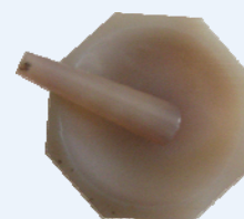
Mortar and pestle