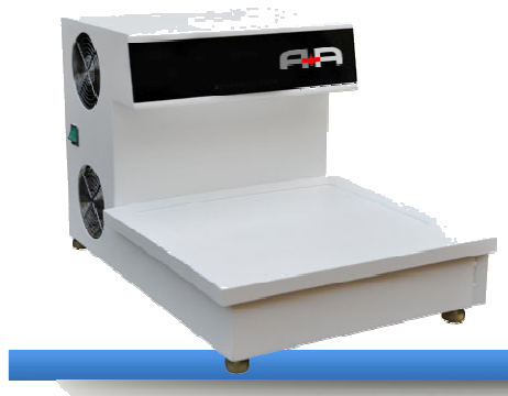
Freezing plate ( optional )