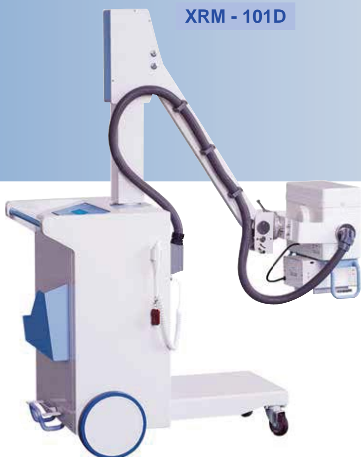
XRM - 101D