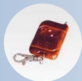
Remote hand-held controller (available in 20 meters)