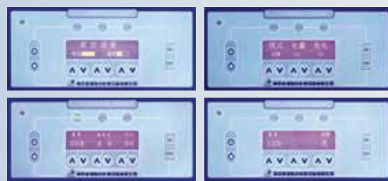
Compact operation panel, intuitive interface, easy to operate.