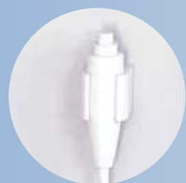
Two gears exposure hand brake